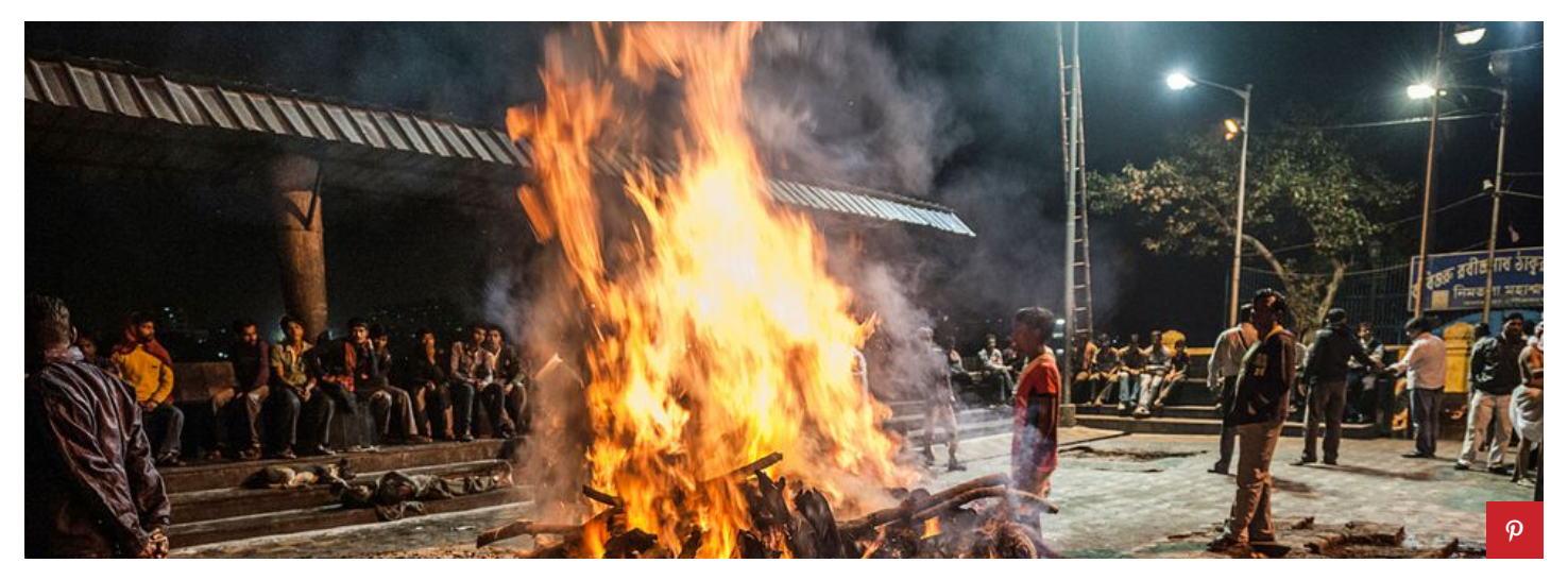
The Nimtala Burning Ghat (Funeral rites) is the oldest and the most famous cremation ground of Kolkata. It is situated in Central Kolkata.

Back in 1980, less than 5 percent of Americans were cremated when they died. That figure now stands at about 50 percent, according to the National Cremation Association of North America. Changing cultural and religious standards are at play here, for sure. But if you want to see one event that accelerated the change, look no further than the Great Recession.